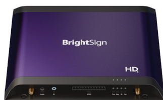
Standard I/O Package