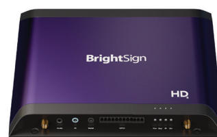
Expanded I/O Package